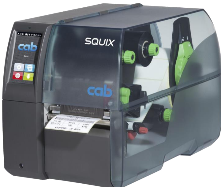
CAB Squix 4 M thermo transfer label printer